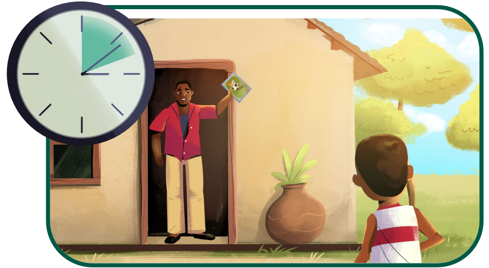
Make reading part of your daily routine