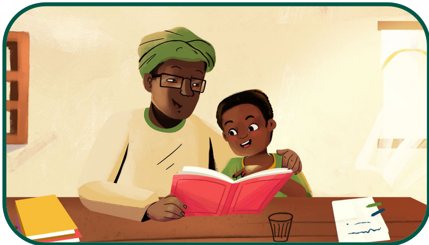
Find a comfortable way to sit together