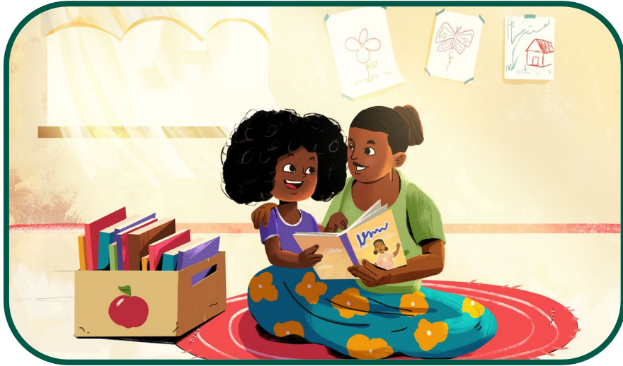
Make a space at home for reading